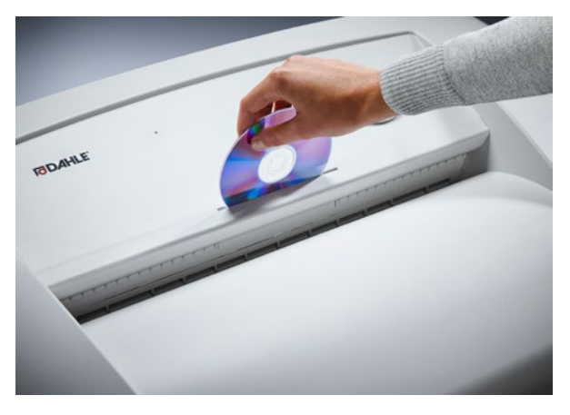
Separate CD feed opening with dedicated collection bin for environmentally friendly waste separation and secure destruction