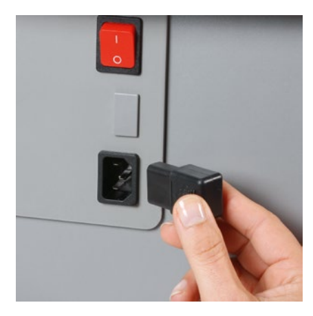
Detachable IEC power plug makes the document shredder quick and easy to move from A to B \,