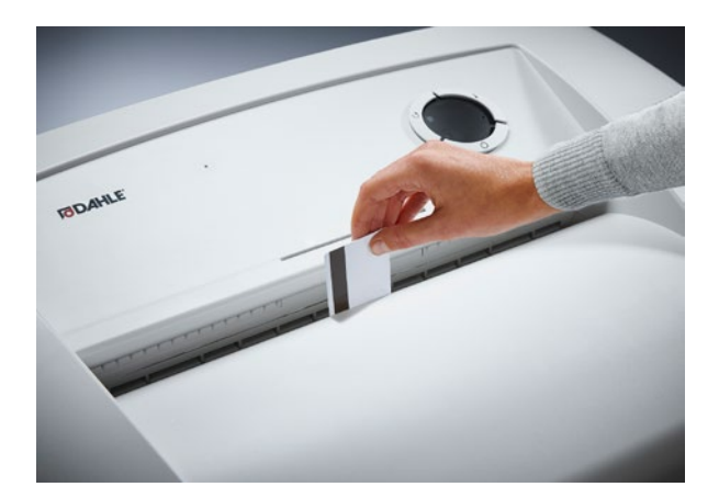
Reliably destroys cards