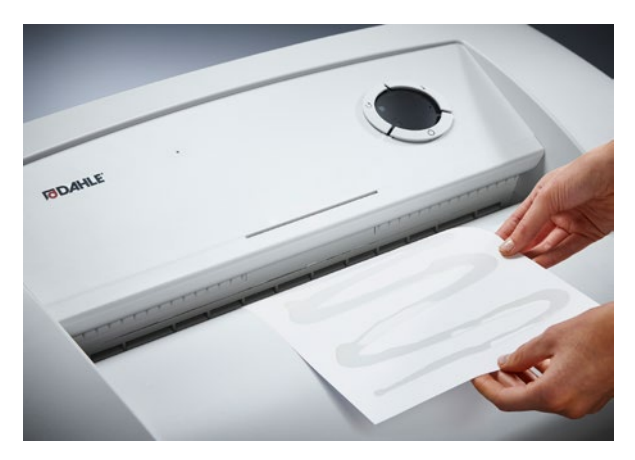
Dahle Waste 116 document shredder